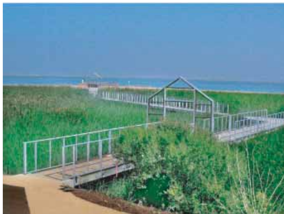
The new boardwalk spanning the Marina