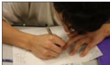
Calligraphy is a form of art therapy, quieting the mind and strengthening focus.