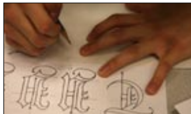
Tracing letters teaches the eye and hand the shape of the letterforms.

Today blackletter is commonly used in tattoos. In fact many tattoo artists create the letters in the traditional style, by hand. Pam, who appreciates the artistic value of many of the tattoos sported by the minors brings in examples from Miami Ink and LA Ink to inspire and engage the youth.