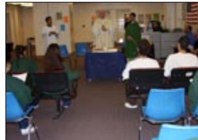
Boys and girls of the Catholic faith attended the special Mass given by the Bishop and held in the Courtroom lobby.