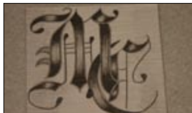
Drawing monograms is a popular project

"Real calligraphy comes from deep within the artist who strives to evoke the true emotion of the meaning of the script through the letterforms they draw."