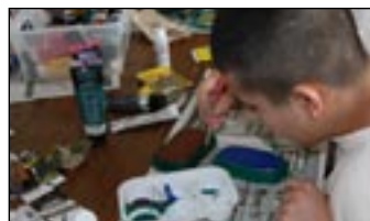
When it is raining, they work on garden plaques to identify plants and personal "signature" riverstones to decorate the garden