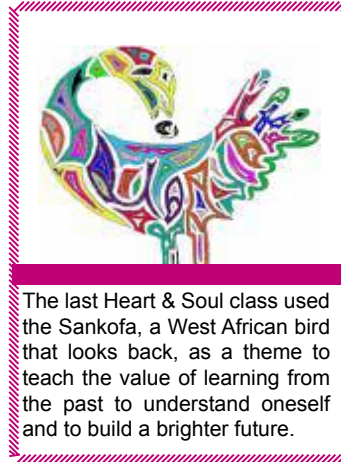
The last Heart & Soul class used the Sankofa, a West African bird that looks back, as a theme to teach the value of learning from the past to understand oneself and to build a brighter future.

The last Heart and Soul class happened during winter break when the girls were out of school, so they attended for 8 straight days. It started with a personal anagram to help them look at their family history and the way in which they were shaped by it and then moved forward to setting an intention for change and transformation beyond the past.