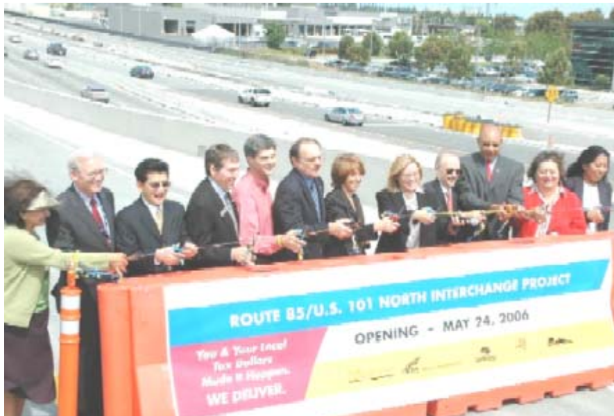
Opening ceremony for the 85/101 N Interchange Improvements in Mountain View, on May 24, 2006