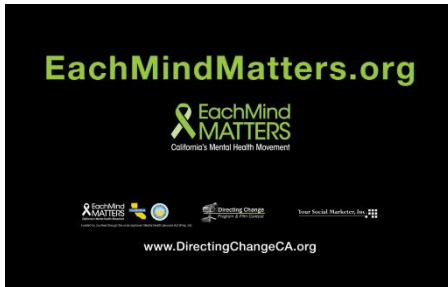
Mental Health Matters

✓ Number Four: My film includes the required end slate. Each category requires an end slate with compilation image of logos and resources which should appear at the end of your film and within the 30 or 60 second limit.