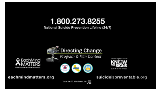
Through the Lens of Culture