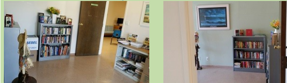
Arts & Crafts Room