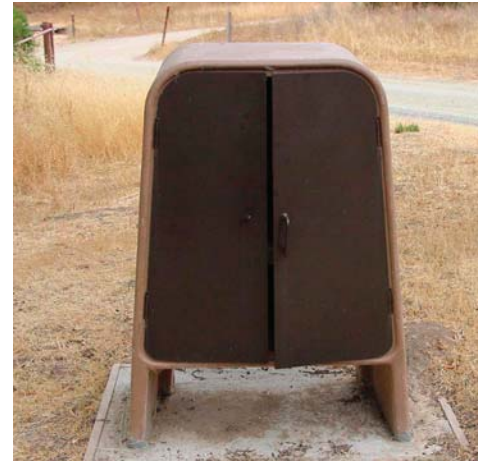
Food Locker $1,635.