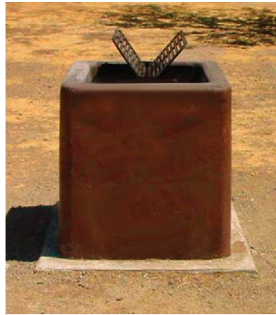
BBQ - Family $1,410.