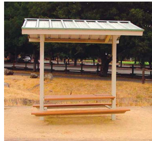
Shade Structure $12,350.