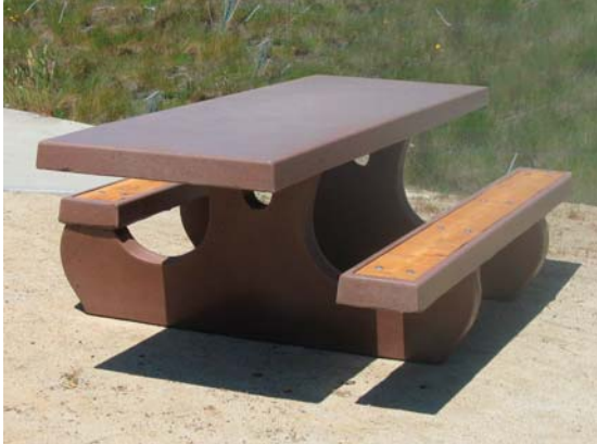
Bench Concrete $890.