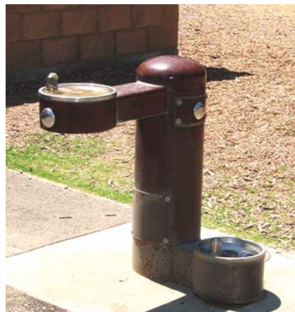
Water Fountain $8,510.