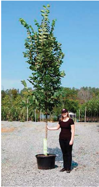
Trees 15 gal. $245. Trees 24" box $285.