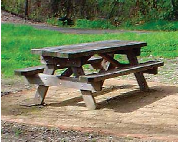
Bench Redwood $620.