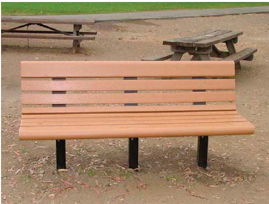
Bench w/back $1,350.