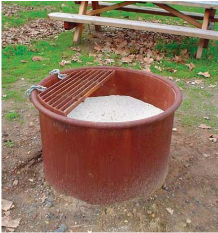
Fire Ring $220.