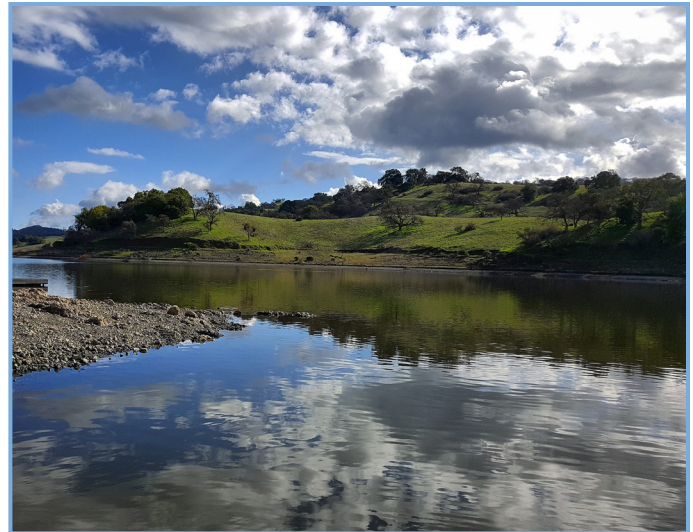
Calero Reservoir in March.

Results from the study, available about six months after completion of the geotechnical work, will help verify embankment and foundation conditions, allowing the engineer to develop final designs for the dam's seismic retrofit.